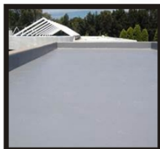
RC Roof Top