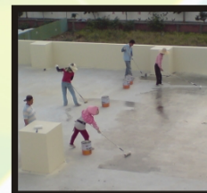
Big Area Apply