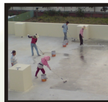
Big Area Apply